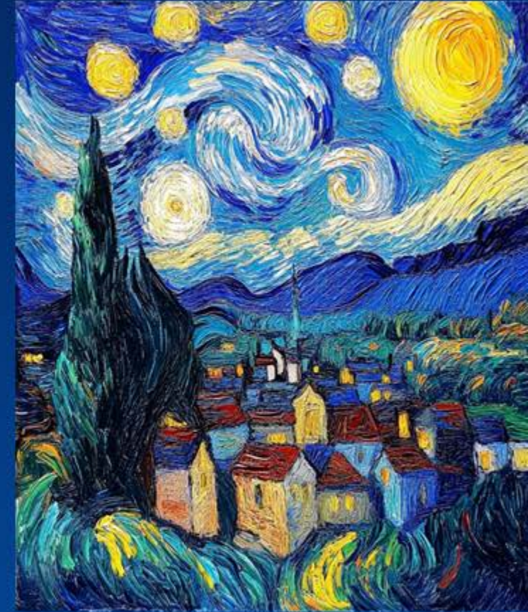
"The Starry Night" by AI