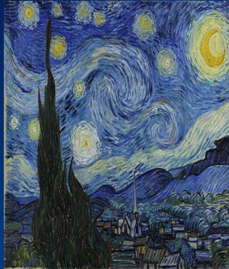
"The Starry Night" by Van Gogh