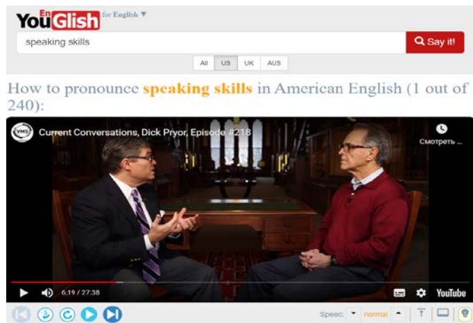
Fig. 1 The example of a word search on YouGlish

of how a word or a word-phrase is pronounced by real people in a certain context. A person can choose among three variants of pronunciation: British, American, and Australian (Fig. 1). In addition to a video, YouGlish also has a script with the word / word-phrase a person is looking for.